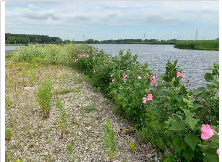
Photo 2: Looking west from east access road at south separation berm.