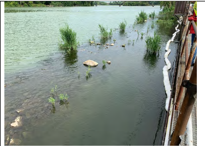
Photo 5: Looking northwest from the walkway of the weir – water levels in the discharge canal are significantly higher than previous years