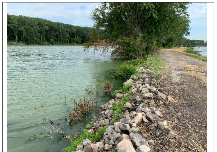
Photo 4: Area along the west berm repaired with additional rip-rap since 2018 inspection