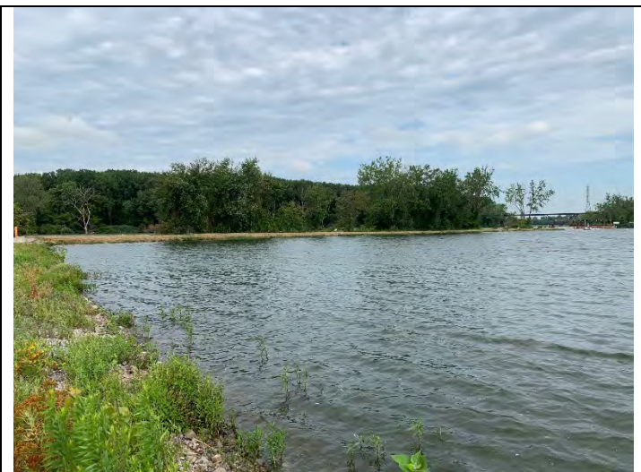
Photo 3: Looking west south separation berm to western edge of impoundment.